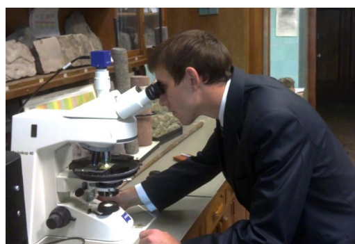
Master's student from DonNTU studies sections in progressing cut.