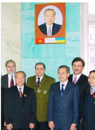
At the portrait in the Gallery of Honoured Doctors of DonNTU

We would like to remind our readers that Dr. Nguen Van An, the Chairperson of the National Assembly of the Socialist Republic of Vietnam (SRV), came to Donetsk as a member of the parliamentary delegation of the SRV. He noted the great contribution of the staff of DonNTU to the personnel training of his country (204 citizens of Vietnam got the degrees at our university, 14 of them defended their dissertations). The National Assembly of the SRV had awarded our university and the staff with the Order of Friendship of Peoples with which Dr. Nguen Van An decorated the banner of DonNTU. The final moment of the meeting was marked with the portrait of the Vietnamese