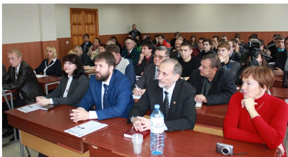
Guests of the forum “Days of German Science and Culture”