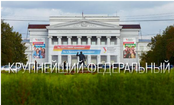
A building of UFU.

There is one implicit requirement which is defense of the master's dissertation. The topics are coordinated by the partner-universities. Both parties of the program supervise the process. Both universities have the State Attestation Commission the representatives of which take part at the dissertation defense procedure which is in the form of the on-line webinar. Our master's students who are trained on the program have their practice at the companies which are corporate partners of UFU and take part at the training and master classes (including the distance ones) of the leading companies of Yekaterinburg and get special certificates that acknowledge their competence in the real business. Besides, our students are invited to participate in international summer schools where they attend lectures of Russian and foreign experts in management and seminars and also develop projects in management in small teams.