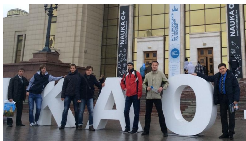
Participants of the science festival «NAUKA 0+».